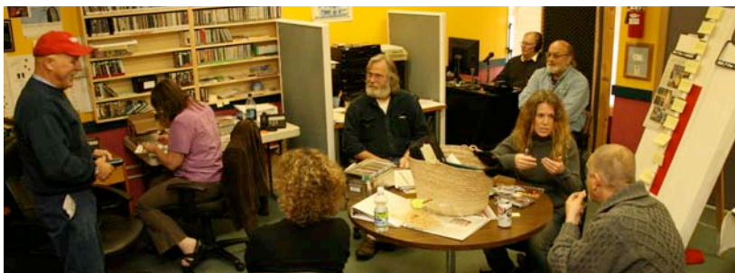
Volunteers support the success of KSER's spring 2007 pledge drive

KSER filed an application with the Federal Communications Commission (FCC) to build a new public radio station serving Whidbey Island, potentially doubling our audience and bringing community-centered public radio service to residents of Island County. The FCC window for applications was the first opportunity in seven years for a new public radio service in the Puget Sound. The frequency, 89.9FM, is the last non-commercial one available in the Puget Sound. It could take three to five years for the frequency to be granted, and the selected applicant will have up to three years to complete construction and begin broadcasting.